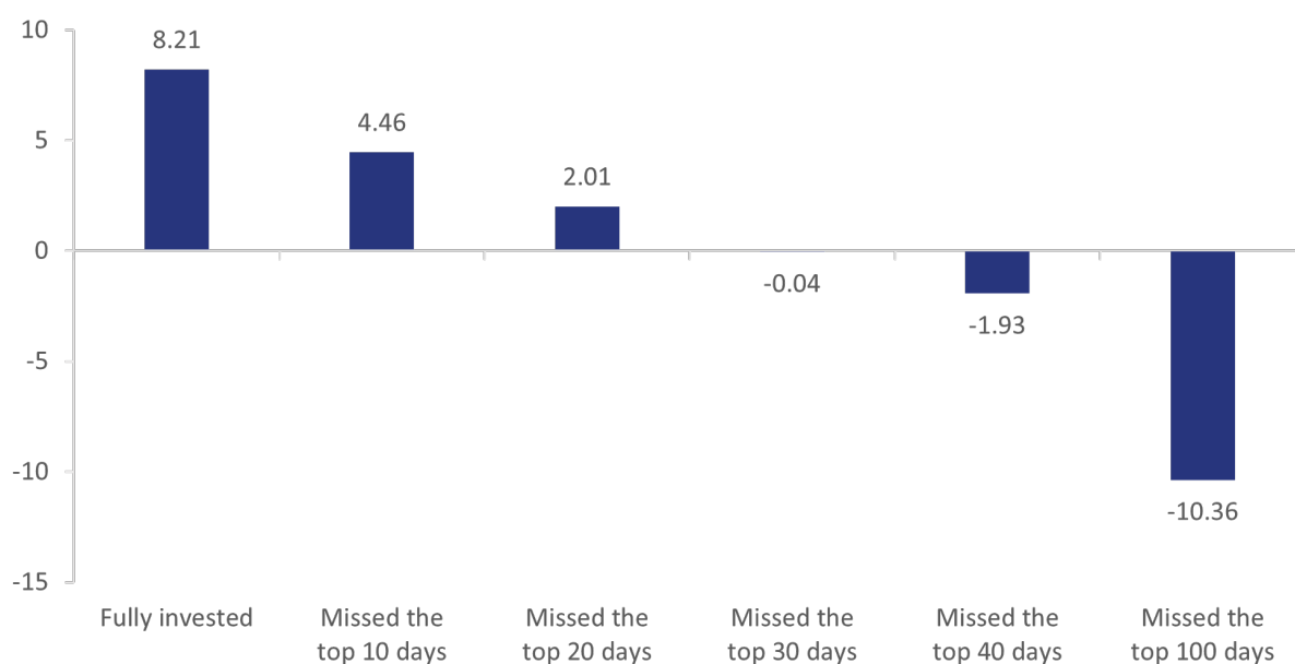
Market returns: S&P 500 Index from 31 Dec '89 - 31 Dec '09

As shown in the chart below, If an investor sells out of the market too early or is too late buying back in the market, they may miss future growth. Missing just a few of the best days in the market can have a negative impact on the value of an investment.