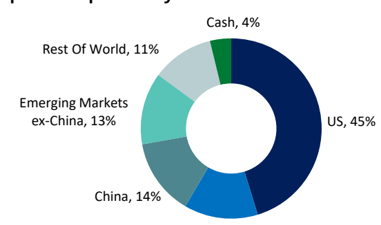
Western Europe, 13%